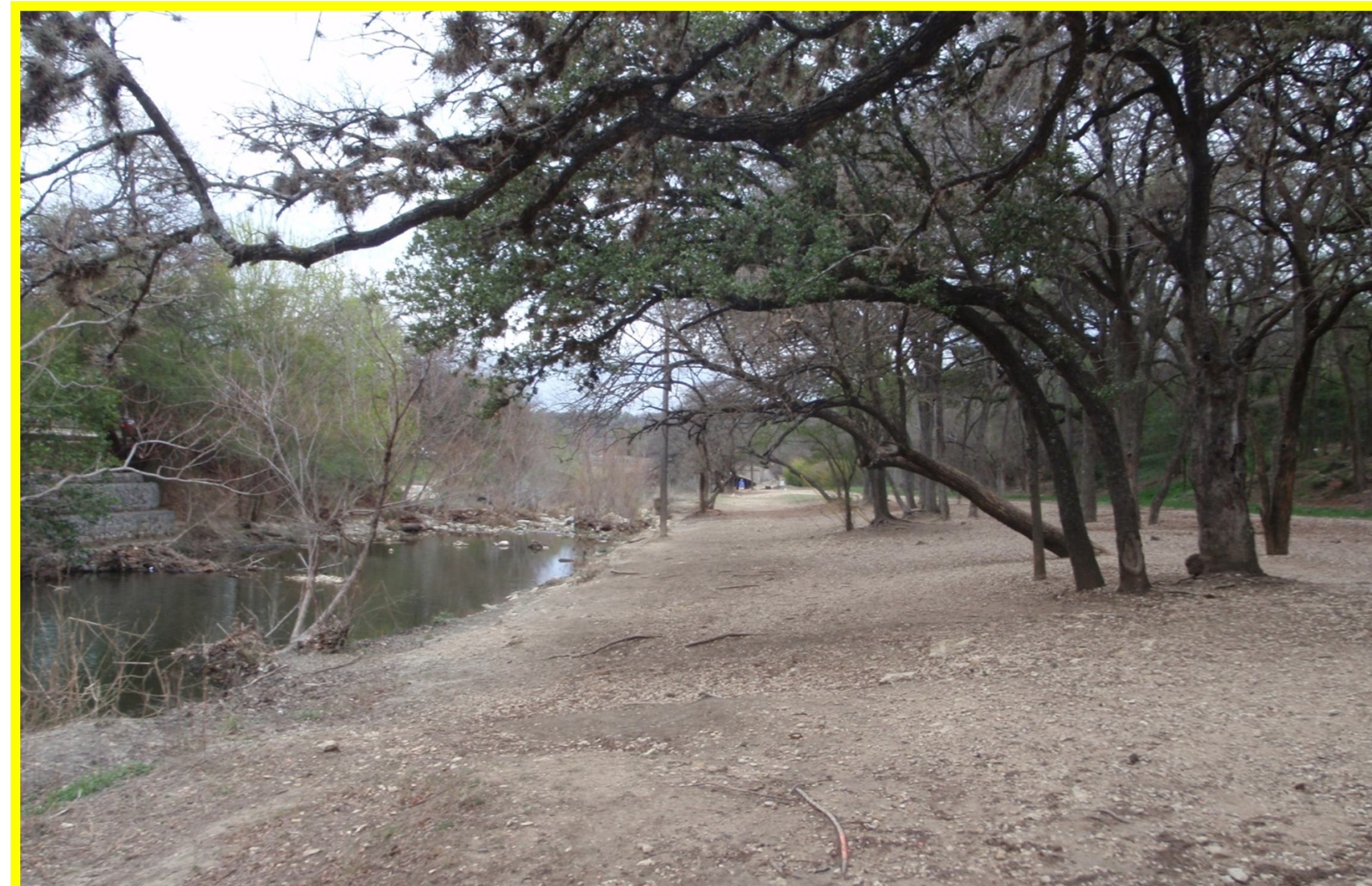
Intensive restoration area: restore soil, protect tree root zones, accommodate park users between creek and grove, establish un-mowed strip of native grass at top of bank