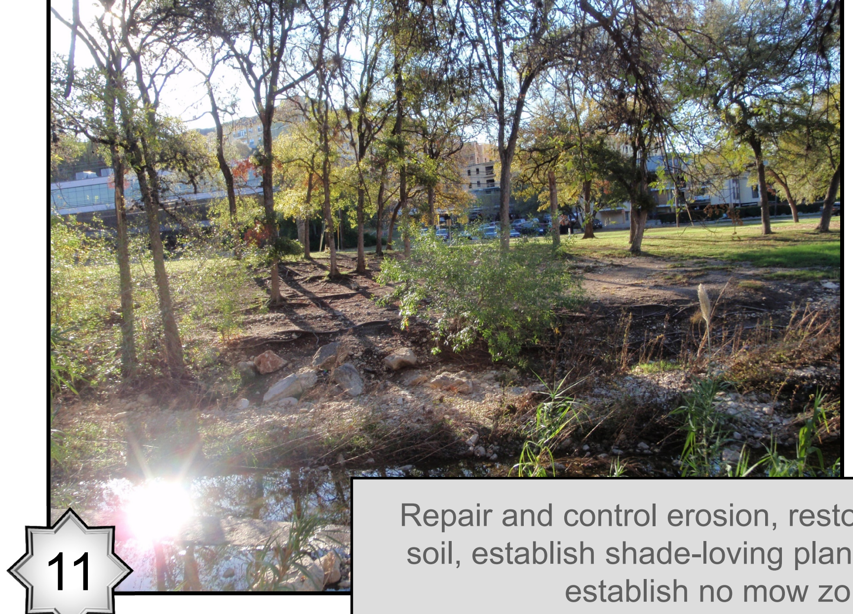
Repair and control erosion, restore soil, establish shade-loving plants, establish no mow zone