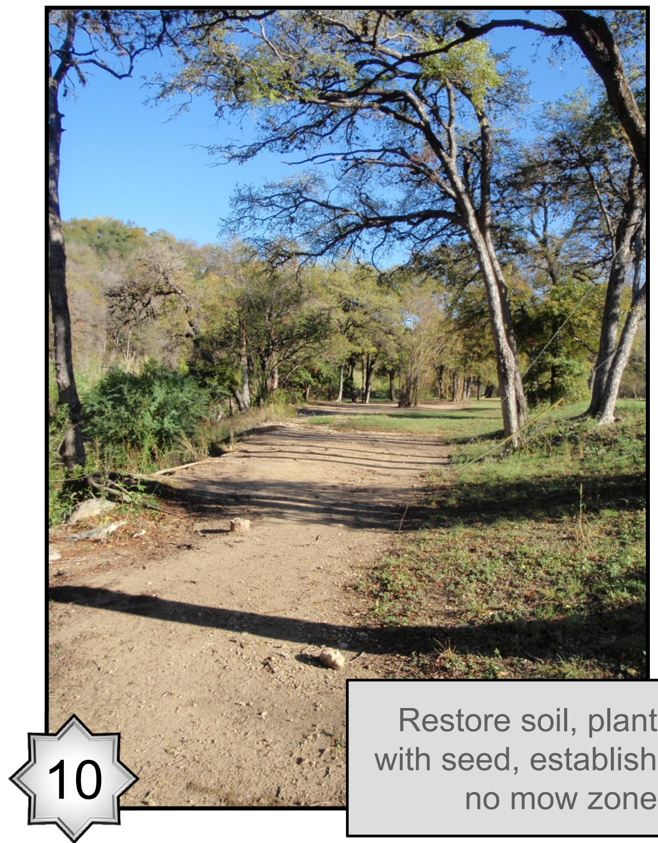
Restore soil, plant with seed, establish no mow zone