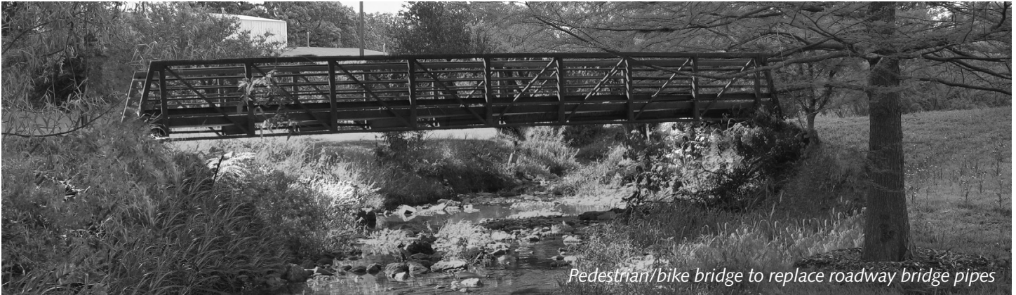
Pedestrian/bike bridge to replace roadway bridge pipes