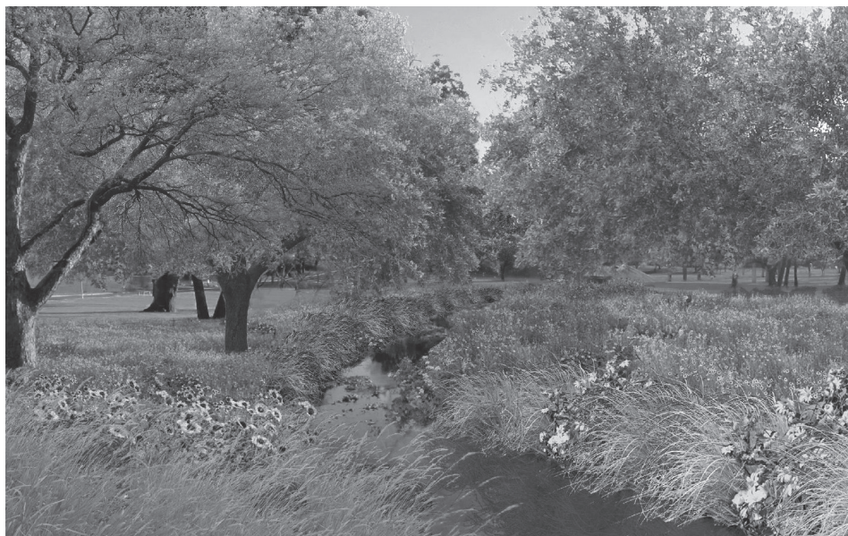
Tannehill Branch project will create riparian parkland and woodland corridor

The project will remove a road that was cut through the park in the late 1960s to accommodate traffic from Robert Mueller Airport. Removing the roadway will create a unified park that has been divided for more than 40 years. It will bring the neighborhood together by creating a unique sense of place for the community to reconnect with the creek.