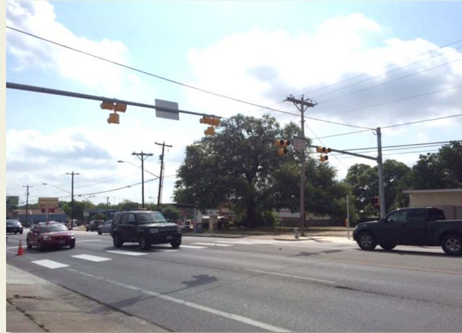
Crossing Improvement: Pedestrian Hybrid Beacon (PHB)