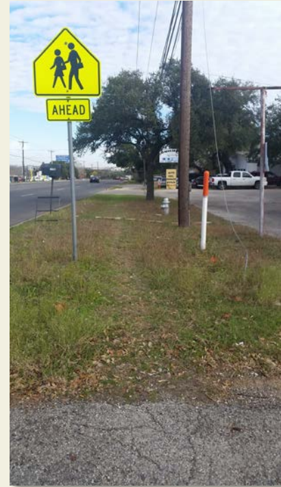
Improvements that can be field engineered