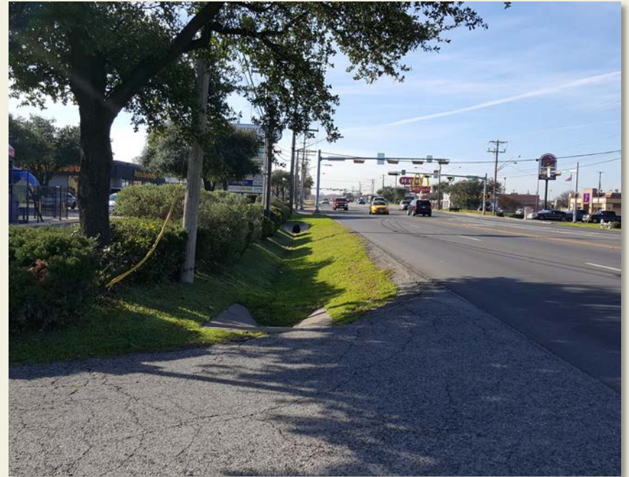
Improvements that require detailed design