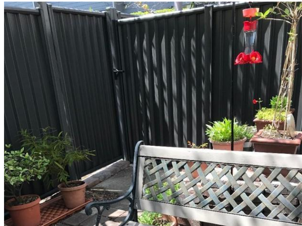
Steel Privacy Fencing